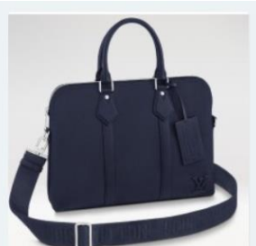
Borsa Louis Vuitton Takeoff Aerogram M21440